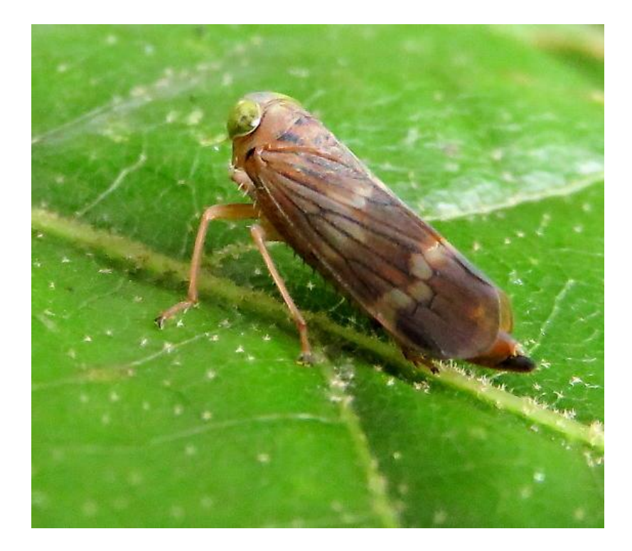
Figure 2. Coppery leafhopper (Coelidia olitoria).